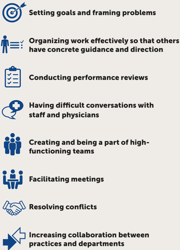
Figure 2 Examples of Topics in the Leadership Academies